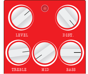
Mid Scoop Brutal