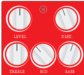
80 Style Rock